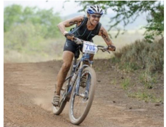
Xterra World Championship, Maui, HI, 2018, 1 st place

of athleticism, experience, and dedication, I'm confident that I can excel in most off-road athletic endeavors.