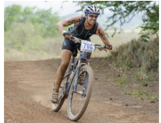
Xterra World Championship, Maui, HI, 2018, 1 st place

As a sponsored age group female athlete who has excelled in a variety of sports—road and off-road triathlon, road biking and running, windsurfing, swimming, outrigger canoe paddling, and most recently ultra-trail running—I have a wealth of experience and record of success. With a passion for pushing myself to my physical and mental limits, I have competed in numerous races, consistently finishing among the top performers in my age group and often out-performing much younger competitors. I was the first woman over age 40 to do both the Kona Ironman Triathlon and Xterra Championships in the same week. I have competed in 24 Xterra World Championships, placing first 10 times in my age group and on the podium every year except one. Through my dedication and commitment to training, I have developed skillsets and abilities that make me an asset to any team or organization. Whether I am tackling steep inclines on the trail or navigating technical terrain on a mountain bike, I bring a level of focus, determination, and resilience that sets me apart from my competitors. As an author I have written more than 60 articles and 3 books including Aging with Strength . With my combination of athleticism, experience, and dedication, I'm confident that I can excel in most off-road athletic endeavors.