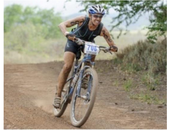
Xterra World Championship, Maui, HI, 2018, 1 st place

As a sponsored age group female athlete who has excelled in a variety of sports—road and off-road triathlon, road biking and running, windsurfing, swimming, outrigger canoe paddling, and most recently ultra-trail running—I have a wealth of experience and record of success. With a passion for pushing myself to my physical and mental limits, I have competed in numerous races, consistently finishing among the top performers in my age group and often out-performing much younger competitors. I was the first woman over age 40 to do both the Kona Ironman Triathlon and Xterra Championships in the same week. I have competed in 24 Xterra World Championships, placing first 10 times in my age group and on the podium every year except one. Through my dedication and commitment to training, I have developed skillsets and abilities that make me an asset to any team or organization. Whether I am tackling steep inclines on the trail or navigating technical terrain on a mountain bike, I bring a level of focus, determination, and resilience that sets me apart from my competitors. As an author I have written more than 60 articles and 3 books including Aging with Strength . With my combination of athleticism, experience, and dedication, I'm confident that I can excel in most off-road athletic endeavors.